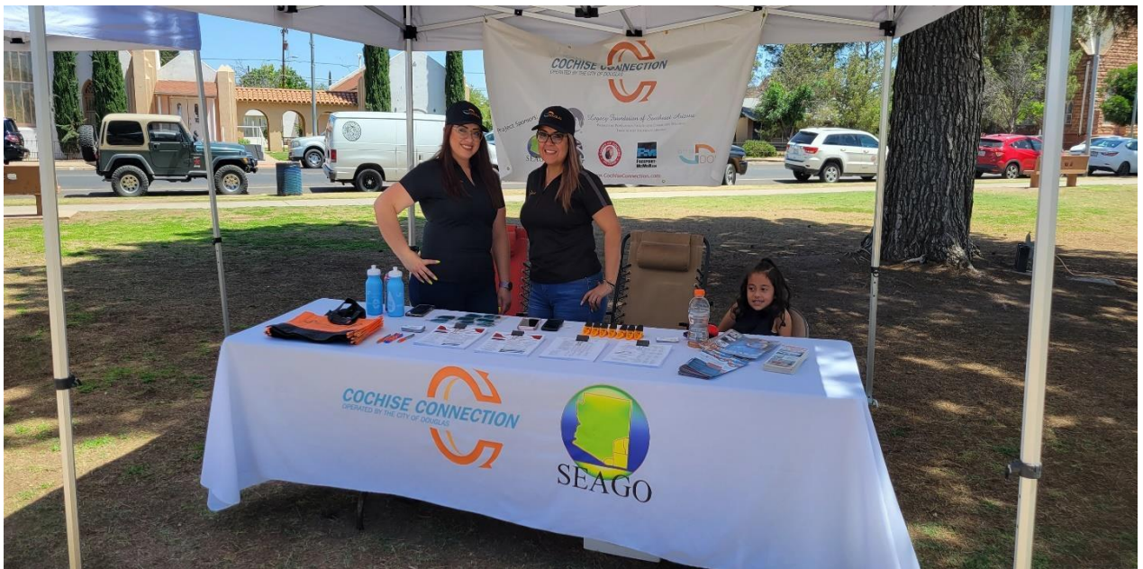
TRANSIT DEPARTMENT "DOUGLAS RIDES" PARTICIPATION AT DOUGLAS DAYS EVENT